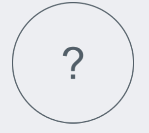
Need for external support in negotiation processes?